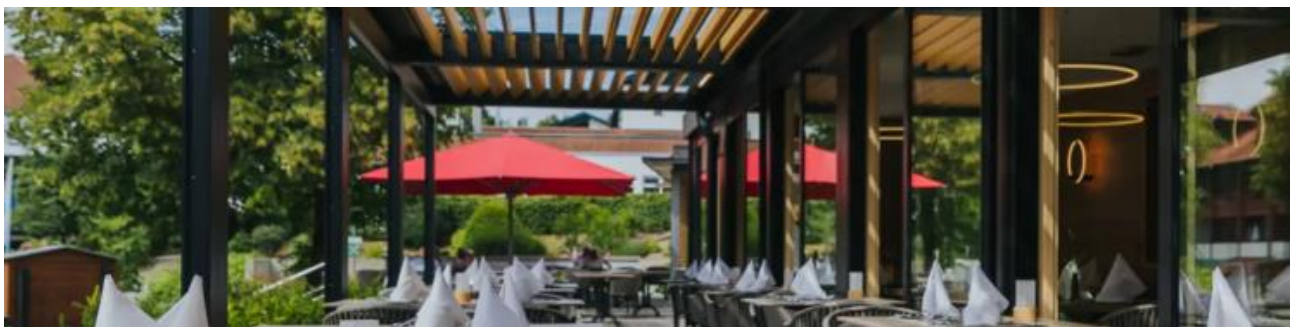
Hotel Drei Quellen Therme

Like ORGANO, we are a family-run business. These values are always something special. However, the main advantages I see in ORGANO lie in the brilliant combination of therapy and health prevention.