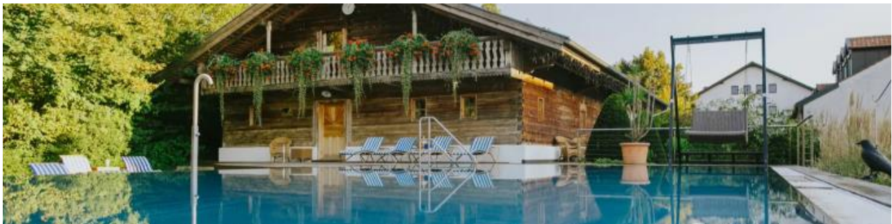
Hotel Drei Quellen Therme

We've noticed an increase in guests coming specifically from the Munich and Nuremberg areas to experience ORGANETIK, often combining it with an extended weekend stay. Even guests from the local area frequently visit us exclusively for ORGANETIK treatments.