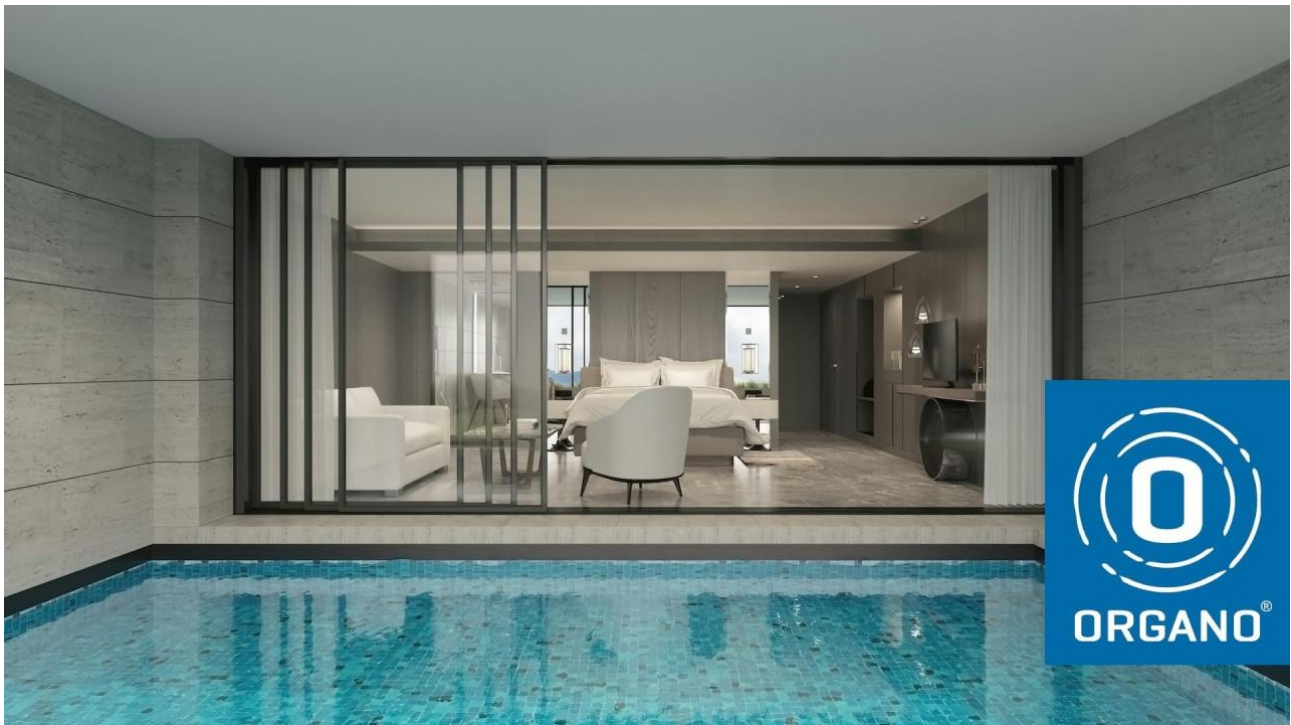
The ORGANO concept for hotels