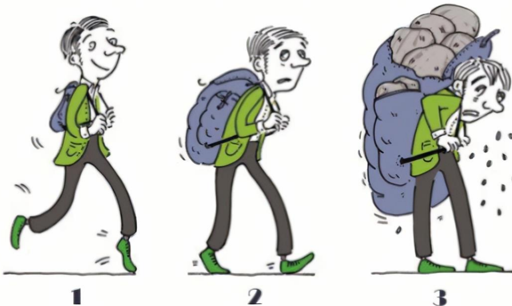
Stage three could be stress and burnout

We like to visualize the energetic burdens as a backpack that fills up more and more in the course of life if it is not emptied. In our opinion, this cannot be done by treating the symptoms, but only by finding and energetically eliminating the cause.